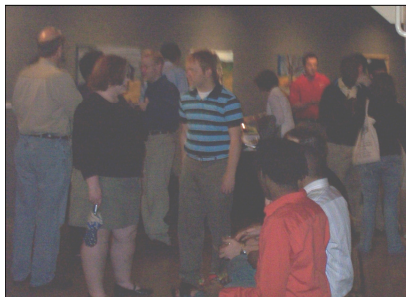
Forensics students at Proclamation Ceremony/Reception

National Individual Event Tournament. At this tourna-