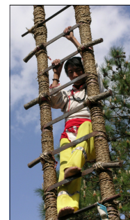
Ladder of knives