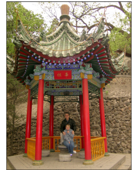
Huaqing Hot Springs Garden