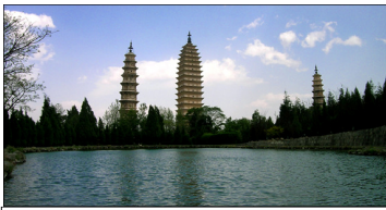
Three Pagodas in Dali

But no, James Hilton's novel, which stamped the name and dream of Shangri-La on the world consciousness, described it as nestled at the bottom of the world's most beautiful mountain. This and some other descriptions mean that wonderful Dali is not Shangri-La. Shangri-La is higher in the mountains, somewhere to the west toward Tibet.