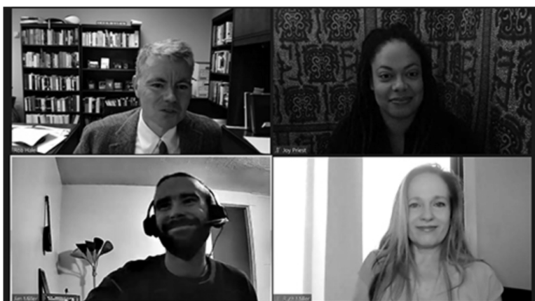
The celebration and workshop this year took place via Zoom's video conference feature.