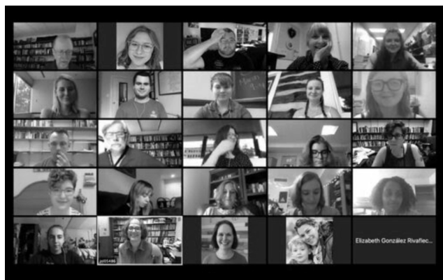
Attendees of the 2020 convocation

On Friday, Sept. 4, 2020, the WKU Department of English held its 4th annual English Convocation via Zoom. The convocation welcomed both new and returning students and highlighted new and exciting opportunities in the English, Film, and Gender & Women's Studies programs.