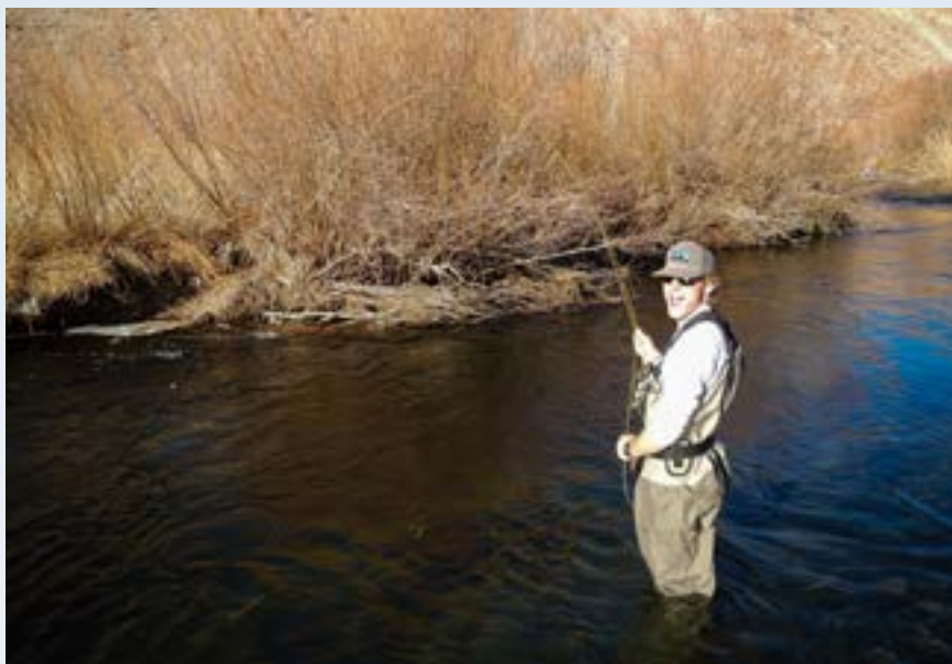
A budding fly angler from Colby College in Maine enjoys the thrill of hooking a fine wild rainbow trout on the lower Owens River in California.