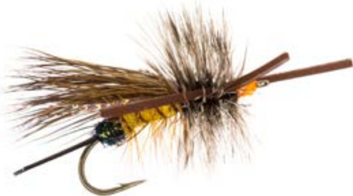
Rough Water Skwala