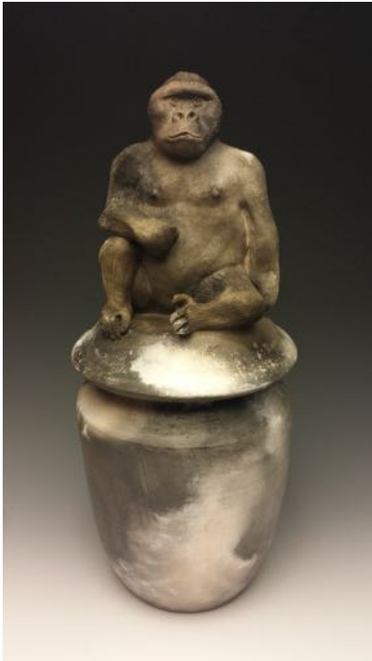
Eastern Gorilla (Gorilla beringei) – Critically Endangered