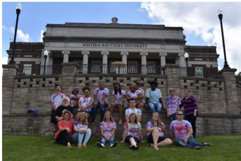
Grant-writers and facilitators with Upward Bound students from the summer "Dress to Express" program

During the program, students explored personal expression and cultural identity in dress and adornment during in-class discussions and, were introduced to ethnography. A favorite assignment was a self-portrait: students created and shared portraits that conveyed their personalities through choices of clothing, props, lighting, and location. ISEC scholars met with the "Dress to Express" facilitators four times to analyze portraits and the messages they send to viewers and to reflect on students' own places within folk groups. ISEC students then had the opportunity to be photographed by students in a photojournalism class at WKU. Ultimately, students will chose one of their portraits to be exhibited in both online and physical galleries, accompanied by short explanations of the portraits written by each student. As the grant funding continues, Siegel, Smith, and Evans will continue to develop workshops focusing on dress and inviting students to create a dress as a team, that will once again introduce students to ethnography and develop cultural sensitivity through the lens of dress and adornment.