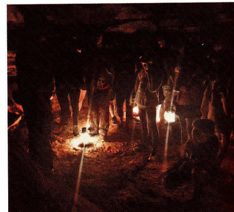
Learning about 3,000 year-old art in the caves