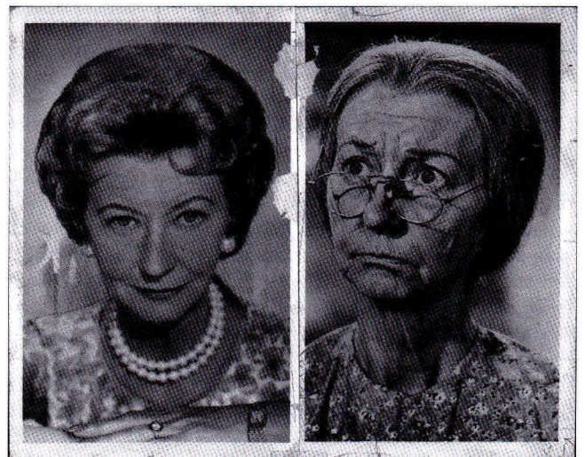
Actress Irene Ryan in her younger days and as Granny on the Beverly Hillbillies