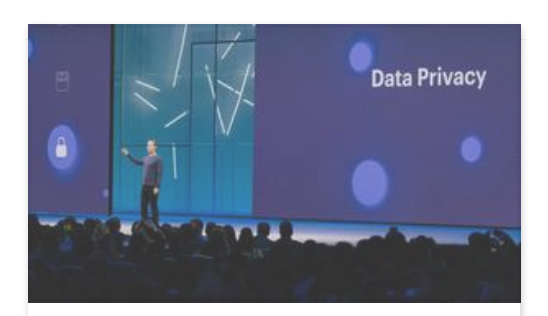
Facebook's new tool lets you see which apps and websites tracked you