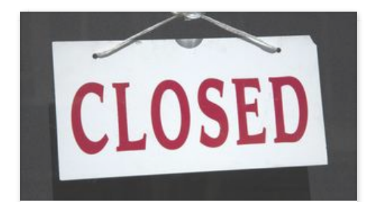
Nations restaurant closes after four years