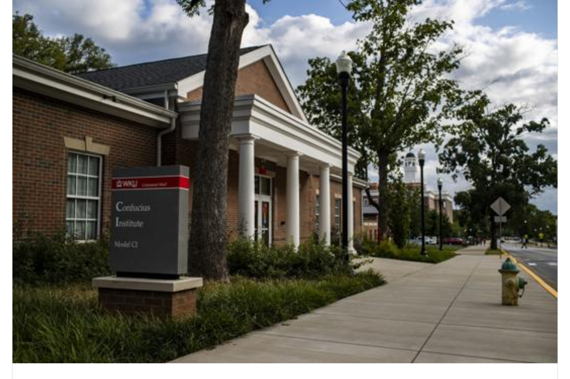
WKU aims to still offer in-school programs after cutting ties with CI