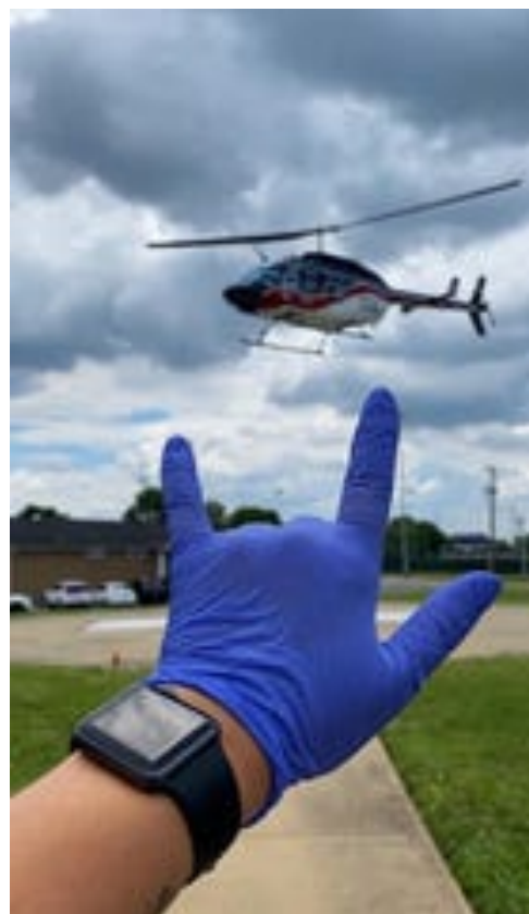
A nurse colleague flashes an "I love you" sign at the helicopter that took ICU nurse Molly Dawson from Bowling Green to treatment in Nashville.

A nurse friend flashed a gloved "I love you" sign language symbol as the life flight helicopter took off, and Patty followed her daughter on the road below. She kept an eye out for the chopper as her foot pressed on the gas pedal.