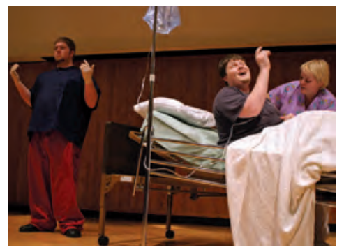
Gallantry, a Soap Opera (Douglas Moore)—2001

after year, they find the artists within themselves and create something that goes well beyond the average student production. They've seen that the university believes in this significant event we call a show, and they compete, prepare, encourage, coach and challenge each other and deliver a remarkable product with maturity and integrity. I know these productions have been a distinguishing feature of our departments for decades. Thanks, alumni. We're keeping your Hilltopper spirit alive.