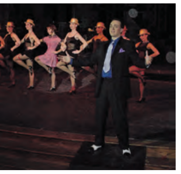
Chicago (Kander and Ebb)—2002