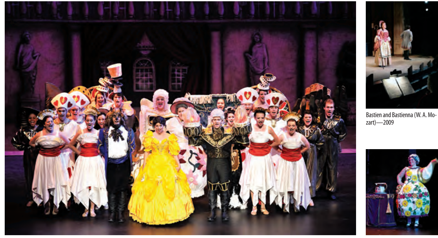
Beauty and the Beast (Allen Menken)-2010