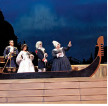
The Gondoliers (Gilbert & Sullivan)—2005