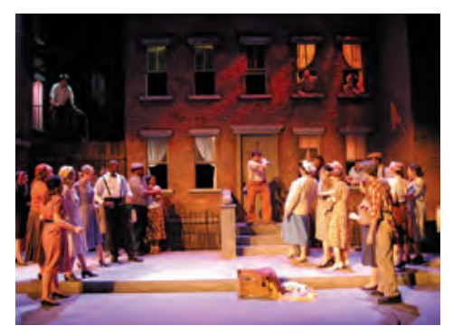
Street Scene (Kurt Weill)—2007