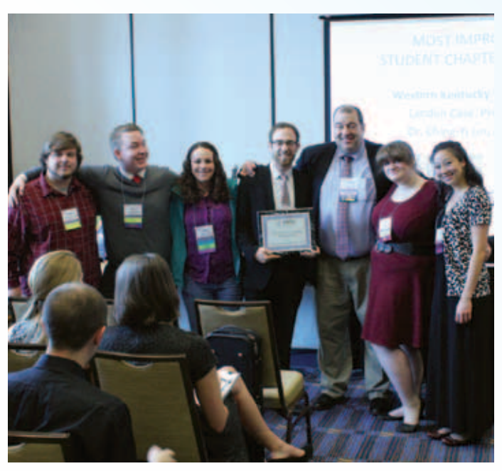
ASTA students receiving Most Improved Student Chapter Award in Tampa, Fla. at the ASTA National Conference

The American String Teachers Association (ASTA) Student Chapter at WKU became an official campus organization in fall 2014. In 2016, the National American String Teachers Association awarded them the Most Improved Student Chapter Award. Members of the chapter attended the ASTA national conference in Tampa, Florida to accept the award in March 2016. ASTA welcomes students who play violin, viola, cello, bass, and guitar. They visit the public schools, sponsor guest artists on campus, and promote string education and performance on campus and in the regional community.