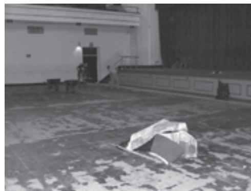
Bare auditorium floor prepared for facelift.

Construction is on the horizon in the guise of Van Meter renovation and the Fine Arts Center addition. As shown on the front cover, Van Meter Hall's renovation began in June 2008, with an aggressive as-