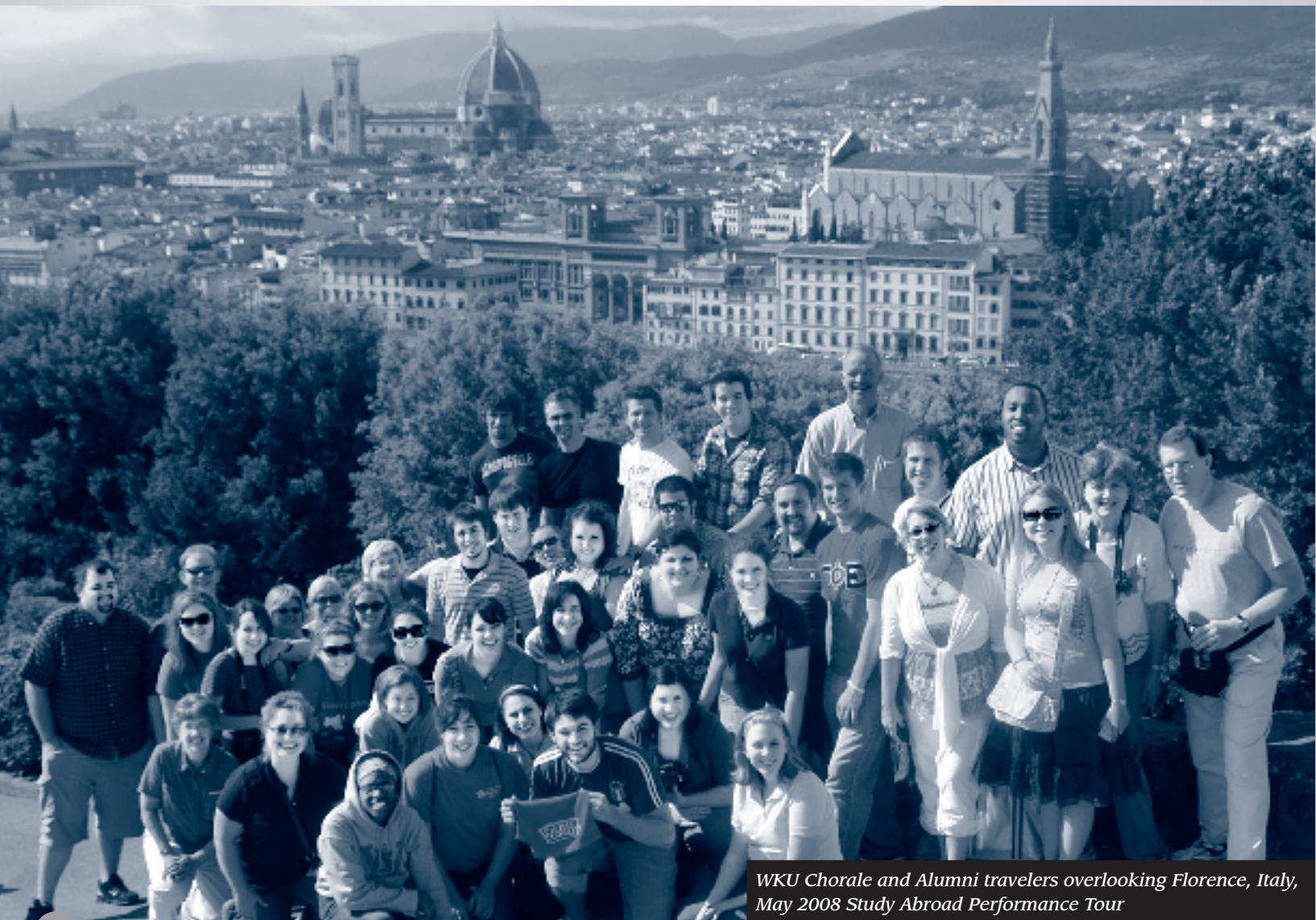
WKU Chorale and Alumni travelers overlooking Florence, Italy, May 2008 Study Abroad Performance Tour

In addition to performing, the choir visited some of northern Italy's most culturally prominent cities: Milan, Venice, Florence, Verona and Sienna. A unique element of this tour was the inclusion of nine WKU alumni and other members of the Bowling Green Western Choral Society, who were wonderful traveling companions to the ensemble and great fans! They rode, ate and toured alongside the students and created unique bonds with the ensemble.