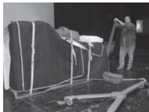
Van Meter Steinway leaves for a refurbishing vacation.

dition. Included in this addition will be a renovated rehearsal hall for use by the choirs, a new instrumental rehearsal hall, percussion suite, faculty offices, and storage for instruments that are in many unusual places in the FAC. If you include the upgraded and cleaned ductwork and air handlers, the new classroom air units, the new roof, the new Recital Hall stage floor and the new elevator, the FAC will have a facelift that be able to meet the demanding needs of music students and community patrons alike. The