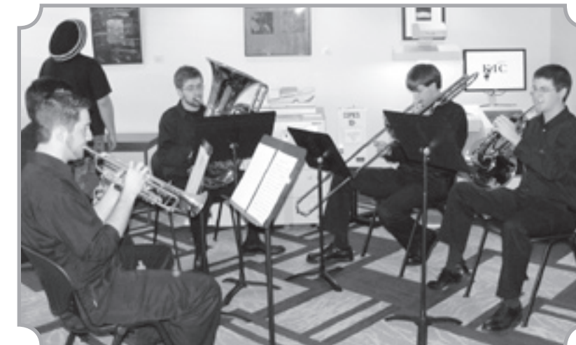
Quintessential at the Visual and Performing Arts Library Grand Opening

A new Student Chamber Ensemble Music Entrepreneurship (SCEME) Program began in the Spring of 2008, which is a student engagement initiative that is a musical rite of passage into the real world. Students learned to be leaders, be team players, developed communication skills, developed the ability to recognize musical and personal problems and solve them, developed a heightened sense of work ethic, learned to be dependable, and developed a mutual respect for their peers. Students were the leaders, the rehearsalers, the correctors, the conductors, the organizers, the planners and the marketers for each of the ensembles that they formed, with minimal help from a faculty coach. Their responsibilities were to have weekly rehearsals, perform on one student recital, perform at one campus/community/regional event, and provide a written assessment of their