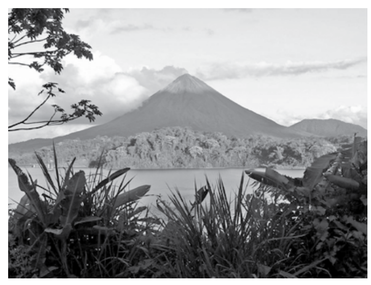
Arenal Volcano in Costa Rica