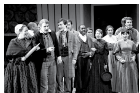
The Game of Chance cast