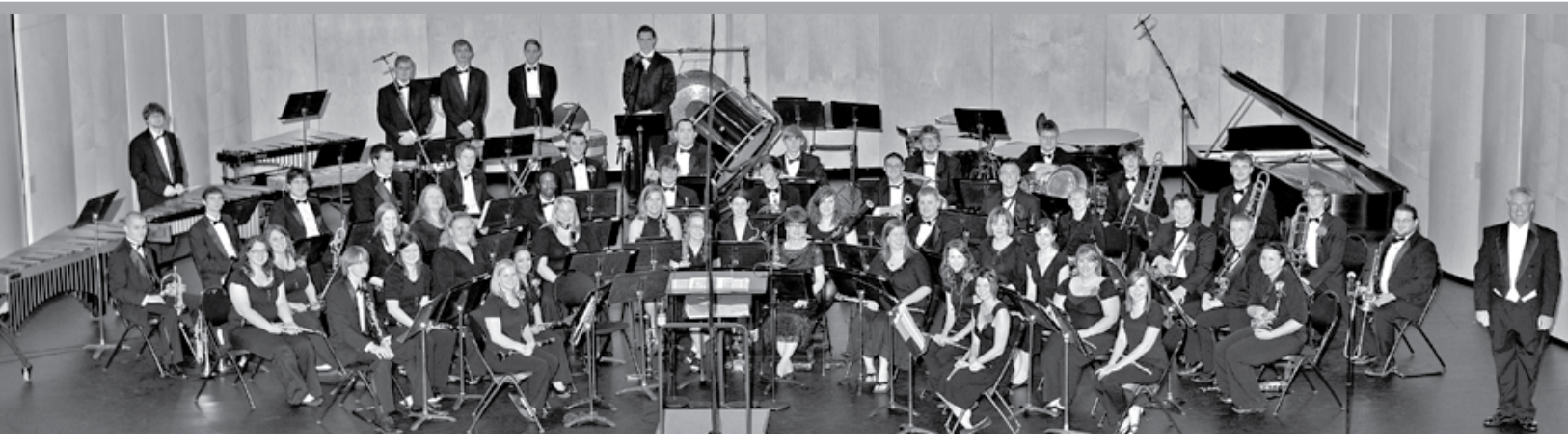
2010 WKU Wind Ensemble in Van Meter Auditorium

This spring, the WKU Wind Ensemble received an invitation from the General Director of Bands under the Ministry of Culture and Youth in Costa Rica to participate in the Fourth Annual Costa Rican Festival of Bands in San Jose on July 4-10, 2011. The Wind Ensemble will present the