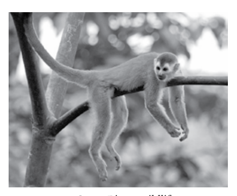
Costa Rican wildlife

engagement for our students is immeasurable.