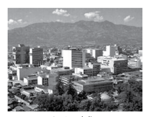
San Jose skyline

This spring, the WKU Wind Ensemble received an invitation from the General Director of Bands under the Ministry of Culture and Youth in Costa Rica to participate in the Fourth Annual Costa Rican Festival of Bands in San Jose on July 4-10, 2011. The Wind Ensemble will present the