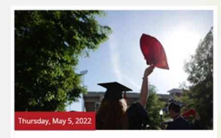
2022 Commencement Ceremony