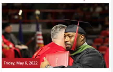
College Recognition Ceremonies