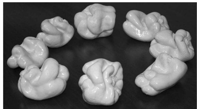
Figure 1. A photograph of the eight natural objects (bell peppers, Capsicum annuum ) used as experimental stimuli for the solid shape discrimination task. Starting from the bottom left (going clockwise), the objects depicted are 1, 2, 3, 5, 7, 8, 11, and 12. These objects are a subset of those developed by Norman et al. [30]. doi:10.1371/journal.pone.0112828.g001

The tactile acuity of all participants was assessed at the beginning of the experiment. Following this, half of the participants were randomly assigned to the visual deprivation condition; these participants were then blindfolded (they remained blindfolded throughout the entire remainder of the experiment). After a 90-minute delay (during which the first author remained with all participants, deprived and non-deprived, and ensured that all participants remained alert by engaging in conversation and/or listening to background music), all participants’ tactile acuity was measured again. Following the second evaluation of tactile acuity, the participants’ ability to discriminate solid shape was assessed. After completing the second evaluation of their tactile acuity and the shape discrimination task, the visually deprived participants were finally (after about 2.5 to 3 hours) allowed to remove their