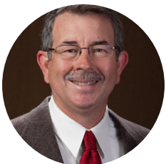
Martin Stone Indoor Garden

Give Goodwill frames new life by pressing dried flowers between 2 pieces of glass in a frame to make beautiful home decor!