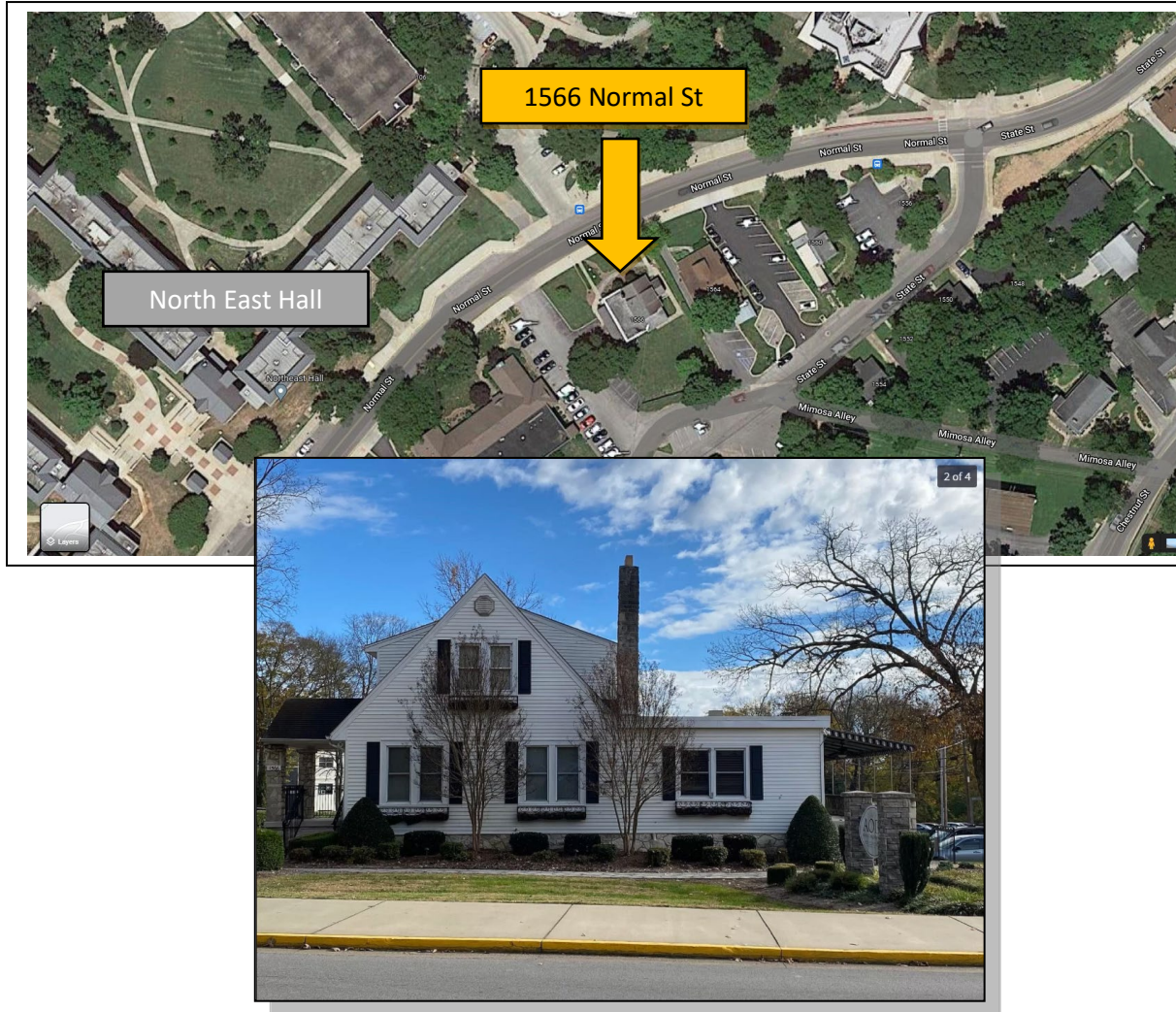
Figure 1. The University is proposing to lease 1566 Normal Street for $30,000 annually.