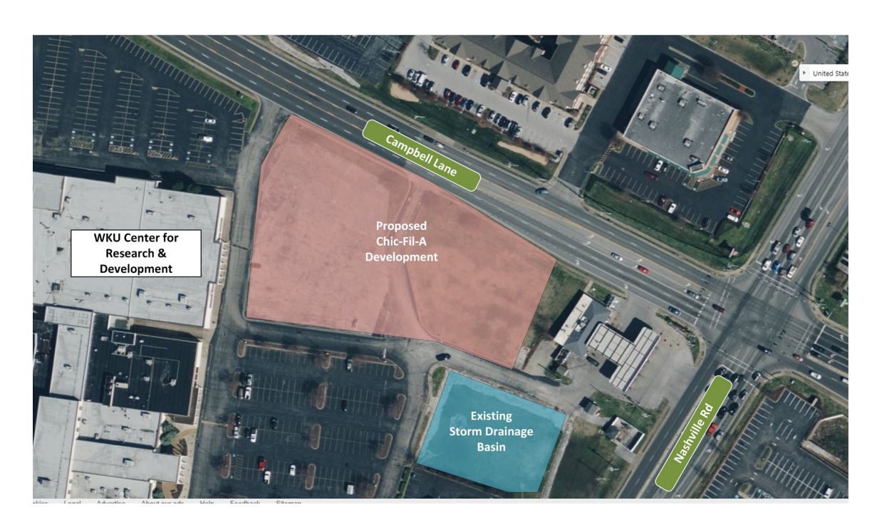
Figure 1. Location of Chic-Fil-A development relative to the existing storm drainage basin on the Center for Research and Development Campus.