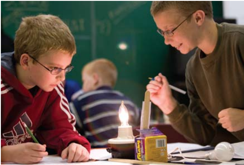
Super Saturdays students

the Summer Program for Verbally and Mathematically Precocious Youth (VAMPY), hosted since 1984 in cooperation with the Duke Talent Identification program. In addition, The Center also runs the Summer Camp for Academically Talented Middle School Students (SCATS), and during the academic year, coordinates Super Saturdays, which allow gifted students in grades one through eight a chance to learn outside of the regular classroom setting. It is the SCATS camp which serves as the setting for the practicum required of those graduate students working toward a gifted certification.