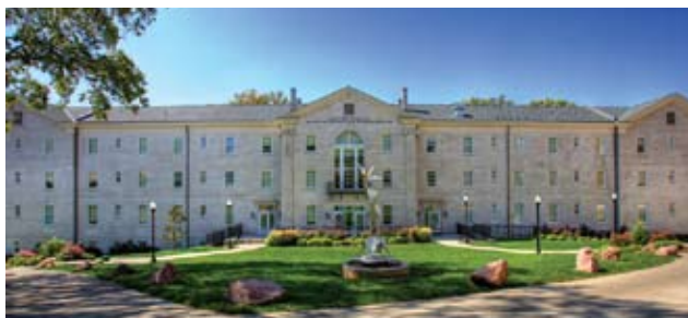
The Gatton Academy