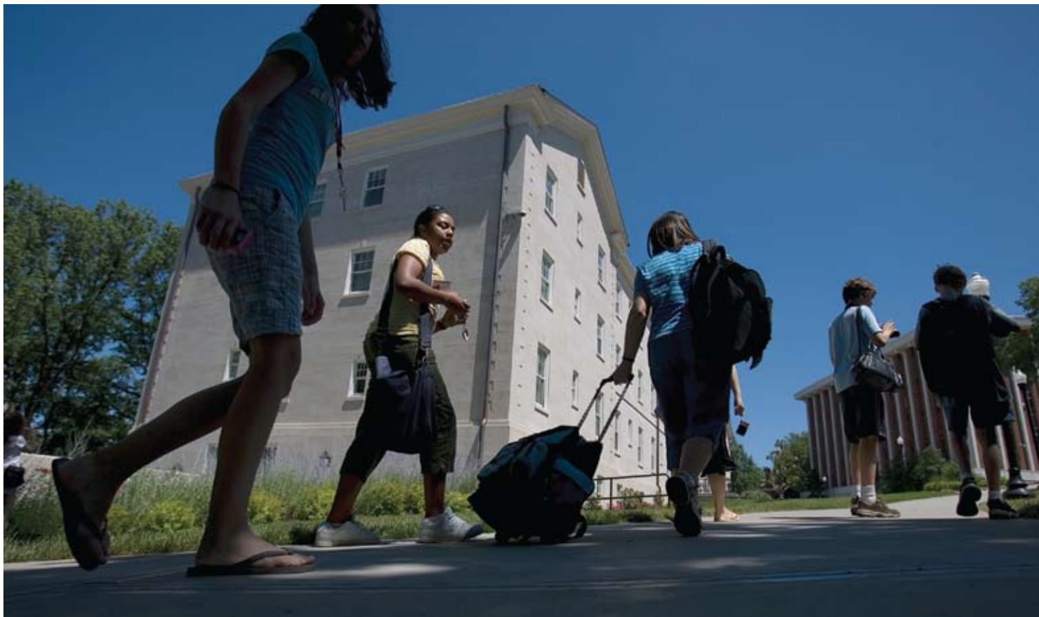
SCATS students walk past the Gatton Academy of Mathematics and Science in Kentucky