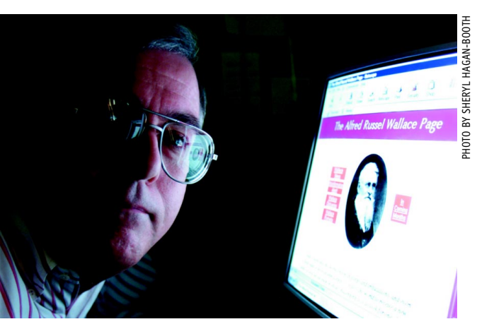
Smith gathers source material on Alfred Russel Wallace, an influential biologist and social critic of the late 19th-early 20th century, at http://www.wku.edu/%7Esmithch/index1.htm.

were found in the journal Nature , a bimonthly magazine. Smith went through every page that was published between 1869 and 1913, and located dozens of lost writings. He also searched through all the issues of a weekly socialist newspaper that came out over a nearly twenty-five-year period ending in 1913, the year Wallace died, and