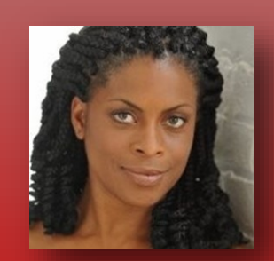
Internationally Recognized Tap Dance Performer / Master Teacher