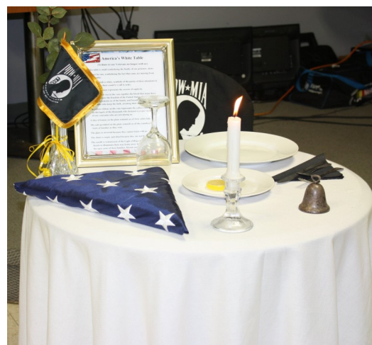
Missing Warrior table