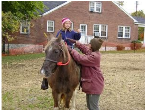
The Kelly Autism Program & Renshaw Early Childhood Center are proud to be recipients of the WHAS Crusade for Children grant.