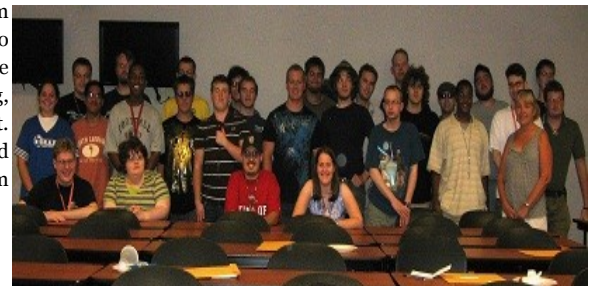
The picture above shows the Fall 2009 Kelly Autism Program Circle of Support Program Participants.